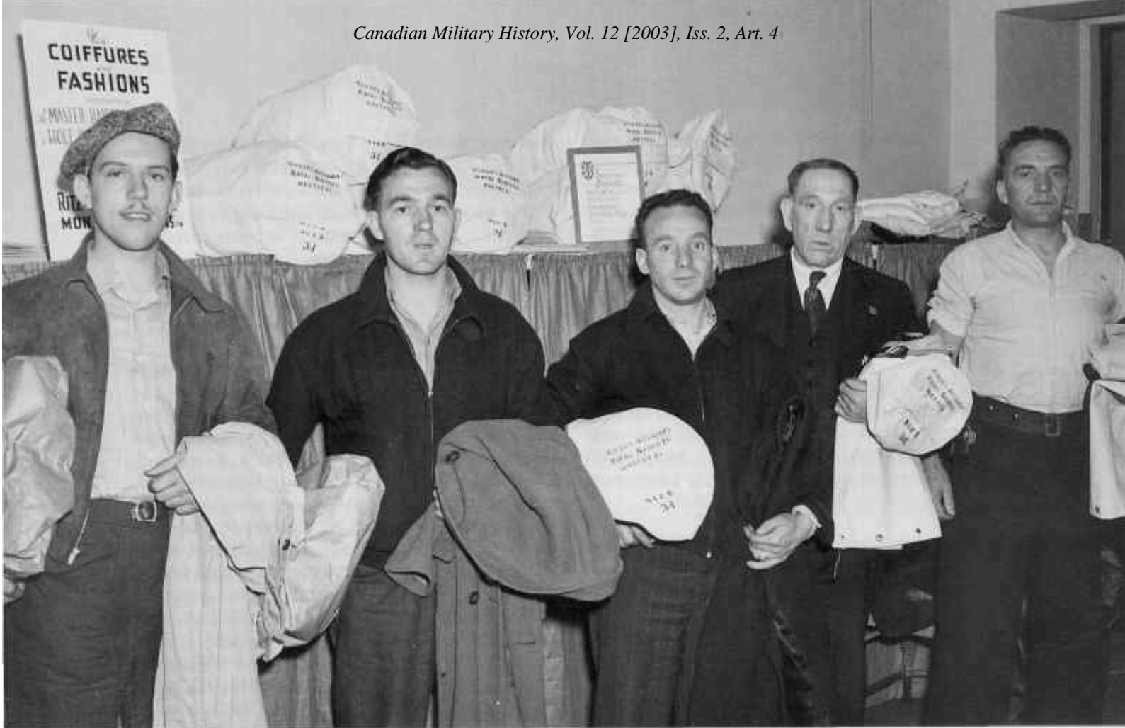
Sailors from a merchant ship torpedoed in the Gulf of St. Lawrence are provided with "survivor's bundles" by the Women's Naval Auxiliary Services, May 1942.

effective and U-553 was unable to make any further attacks on shipping.